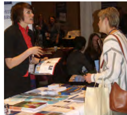
EXHIBIT HALL 7 A.M. - 5 P.M.

Re-entry implies a tense moment of re-emergence out of the distant ether into known territory: the NASA syndrome. This is, we believe, the wrong metaphor. It creates an expectation of anguish rather than a sense of positive re-engagement. Students have, in short, been in another country not in another universe.