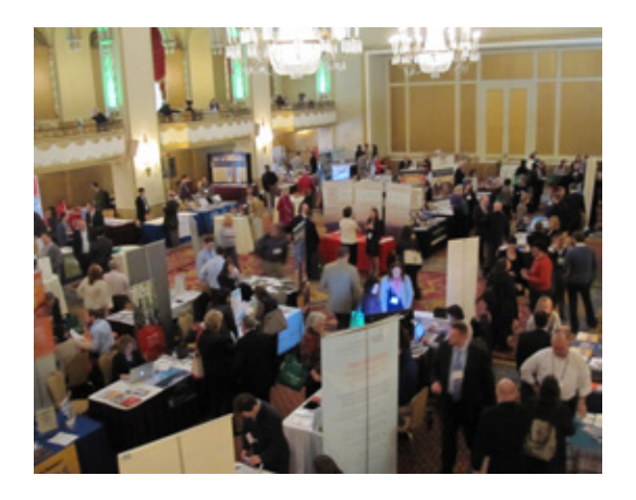
EXHIBIT HALL | 8 A.M. - 5 P.M.

An opportunity to learn about the programs and services offered by Forum member organizations.